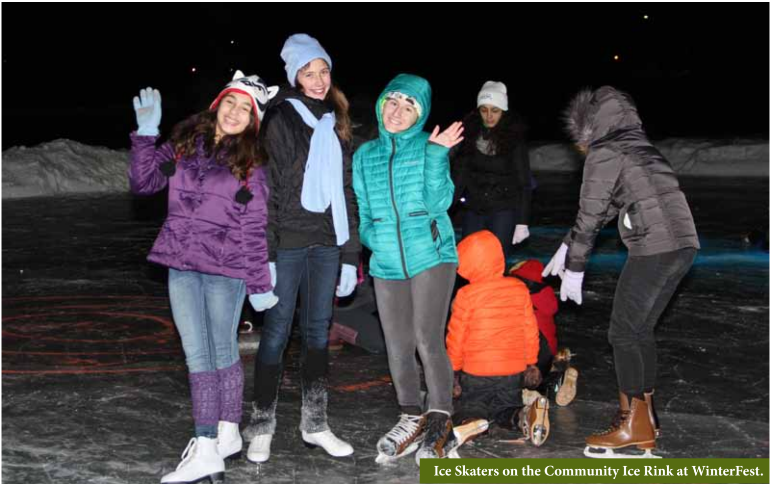
Ice Skaters on the Community Ice Rink at WinterFest.