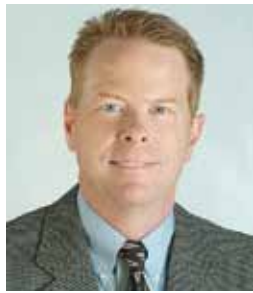
Tom Truedson Commissioner