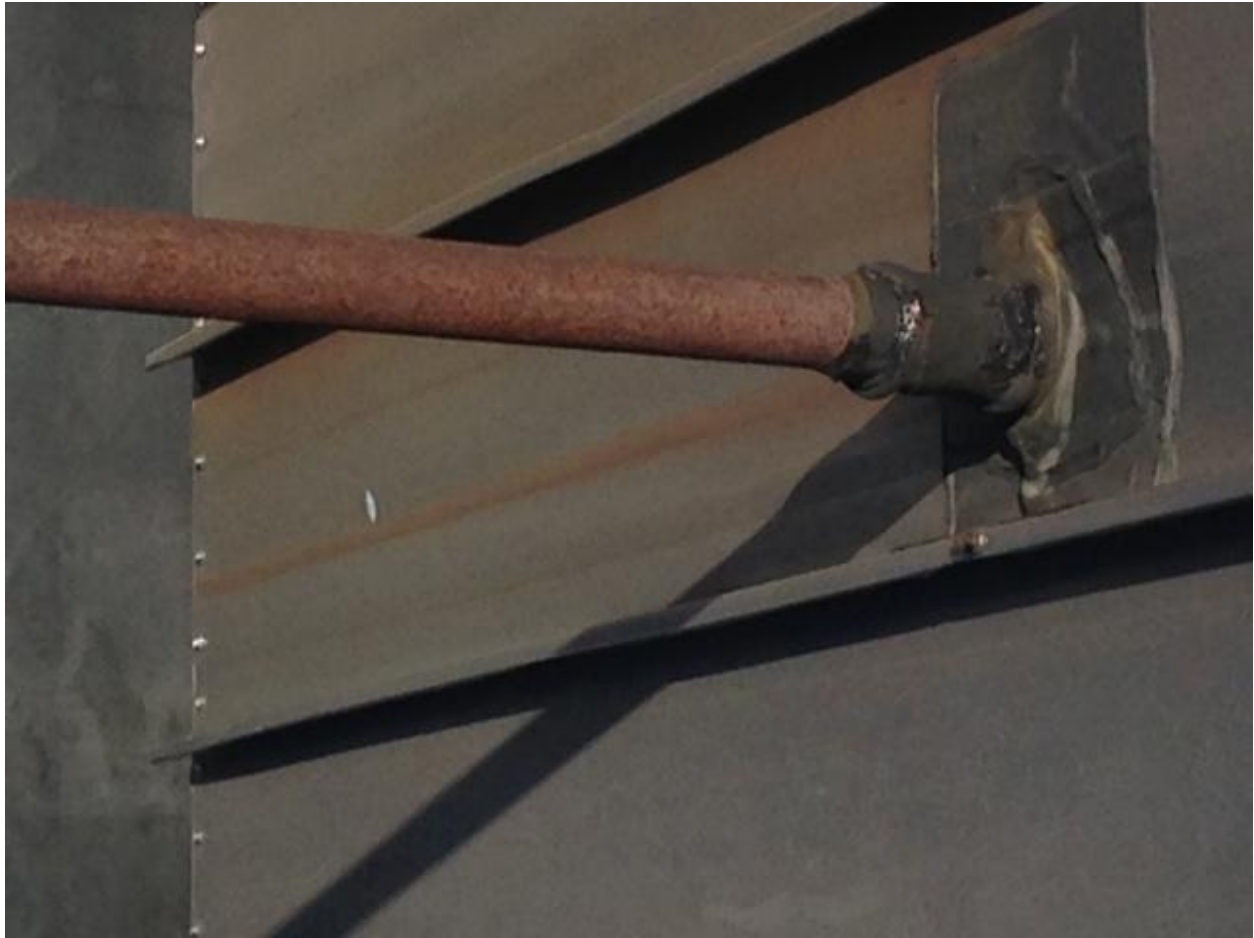
Gas Pipe Penetration Area