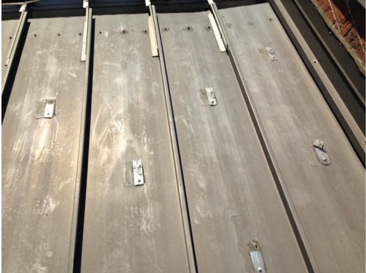
Snow Guard Screw Holes by Court 5