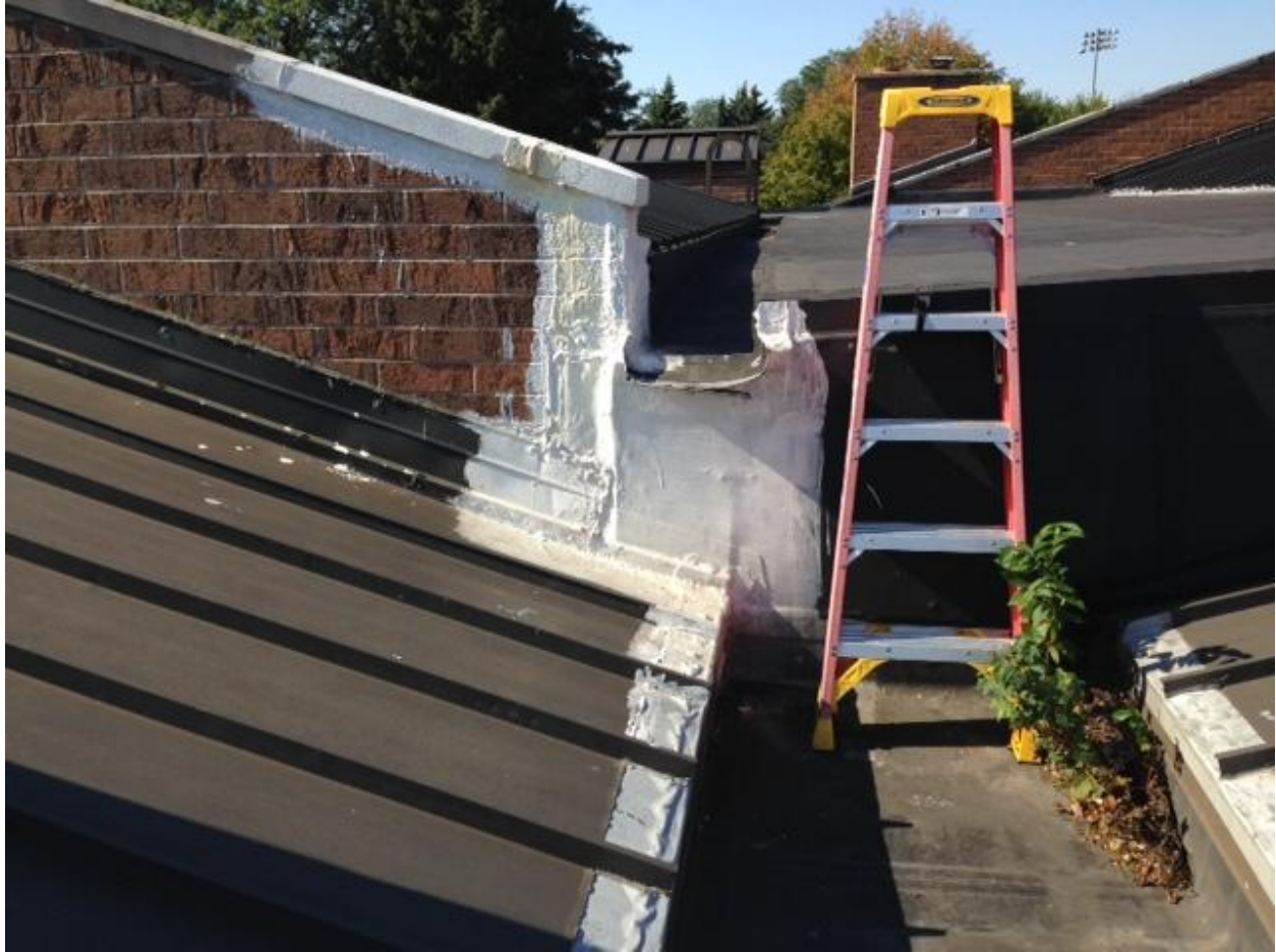
Flashing by Court 5 Area