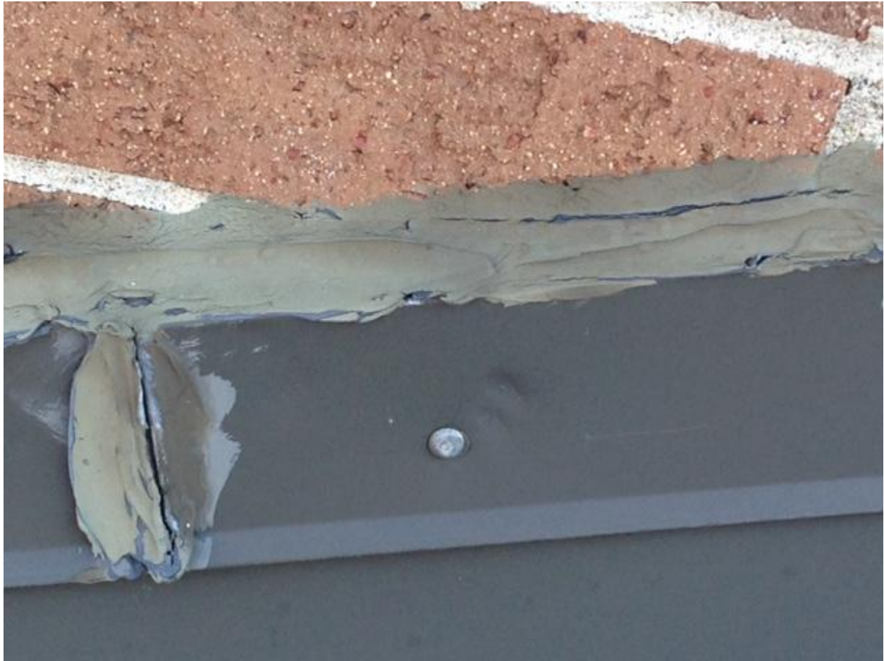
Sample of Flashing by Parapet Walls