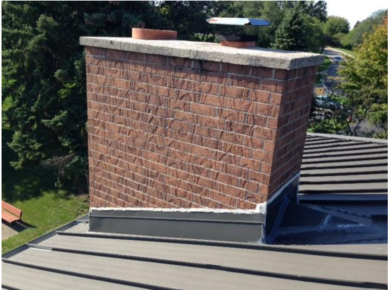
Chimney Flashing Area

Provided on the next 5 pages are pictures of the identified roof areas to be sealed. Contractor shall perform an inspection of the roof to determine other areas requiring repair. Contractor shall specifically document all areas in which work was performed.