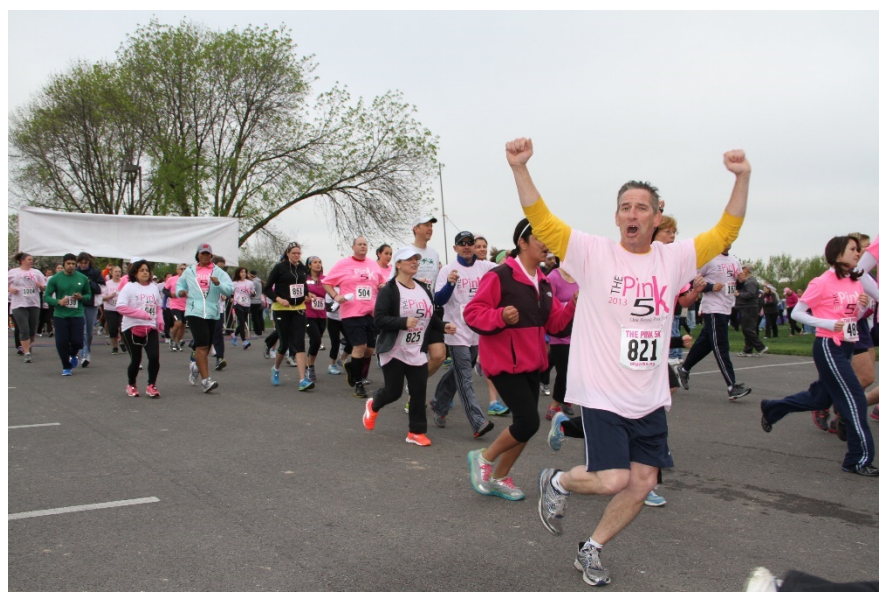
Our partners keep our community Happy, Fit, and Active!

Please consider joining our nationally recognized and award-winning agency in our efforts to help the greater Chicagoland area be its very best & feel its very best.